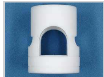
Holder for Sensor M30 - tube 3/4", PTFE